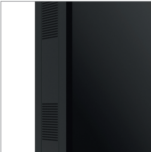
Display specific adapted, e.g. ventilation, infrared sensor

The surfaces are coated with a corrosion resistant, highly weather proof plastic powder coating in black (RAL 9005).