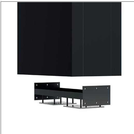
Floor attachment including level adjustment